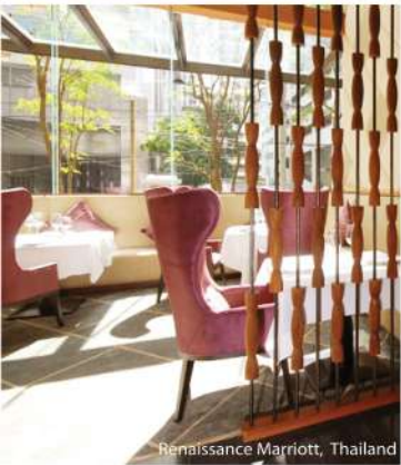
Renaissance Marriott, Thailand

Thai Carpet combines insightful R&D, thorough product testing, cutting edge CAD engineering, dynamic computer aided design, unremitting quality assurance and carefully coordinated production scheduling and control into a master matrix, totally focused on the all important goal of complete customer satisfaction.