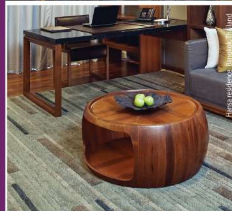
Hansa residence Bangkok, Thailand