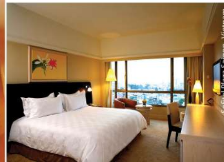
Sofitel Plaza Saigon, Vietnam