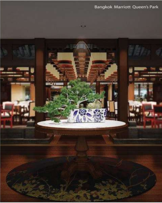
Bangkok Marriott Queen's Park

Thai Carpet, a market oriented foundry which combines technological development, manufacturing aids and trade into its own operation, with the right of self managed export and boasts its state of art craftsmanship, profound teachical command and well equipped quality control measures.