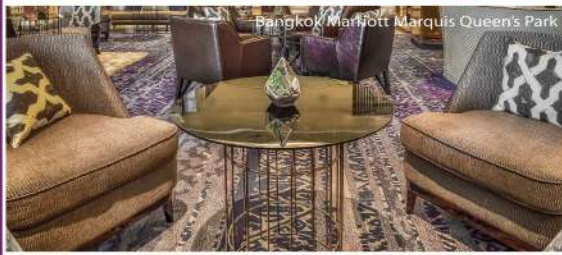
Bangkok Marriott Marquis Queen's Park