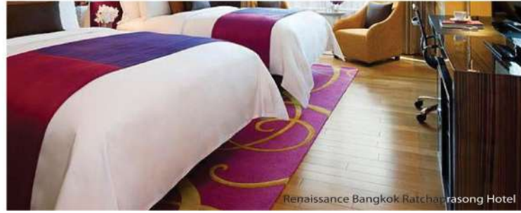
Renaissance Bangkok Ratchaprasong Hotel