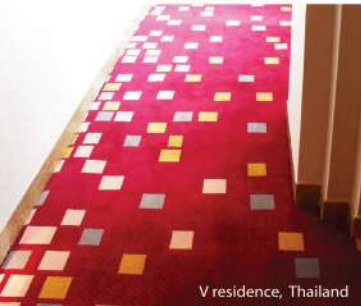
V residence, Thailand