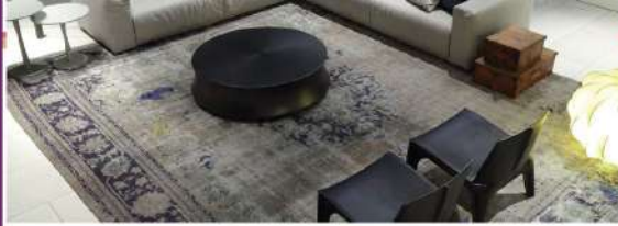
Bangkok Marriott Sukhumvit 57

Hand tufted carpet and rugs provide an ultra luxurious custom look used for the most important public and private spaces, lobby areas, promenades, grand staircases and even ballrooms in 5 and 6 star hotels can be fitted with custom rugs produced in seamless widths as 39 feet. Hand tufted carpet can be used as an area rug, inlaid into hard surfaces or installed wall to wall.