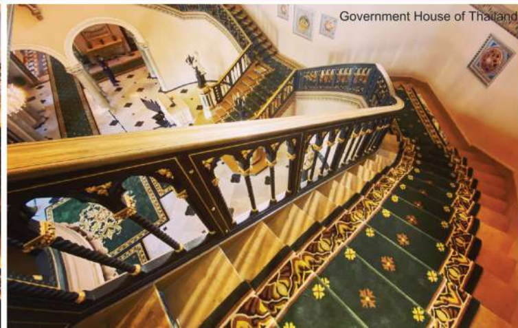
Government House of Thailand