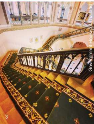
Government House of Thailand