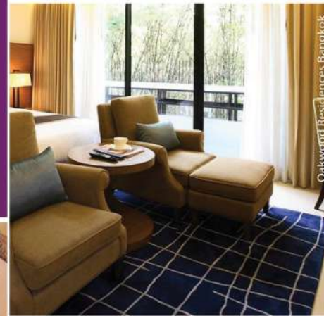
Oakwood Residences Bangkok