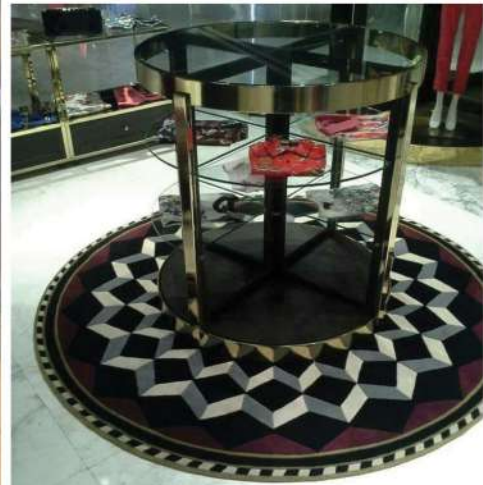
BKK Designer Office