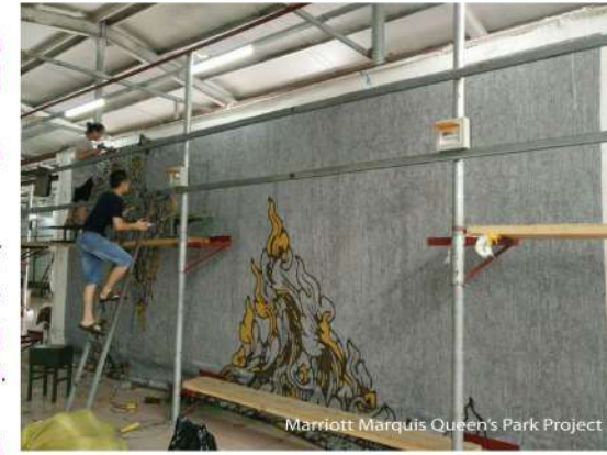
Marriott Marquis Queen's Park Project