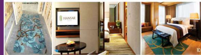
Renaissance Marriott, Thailand